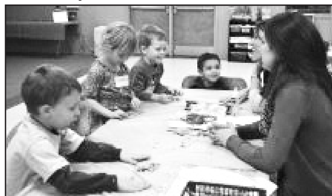
The CEC (Child Enrichment Center) three year old classes held a fun craft day on December 10th. The children made ornaments, decorated cookies and had story time. Thank you to all of our parents, grandparents and babysitters who volunteered their time with our precious children! Merry Christmas! NDec24,214/CA