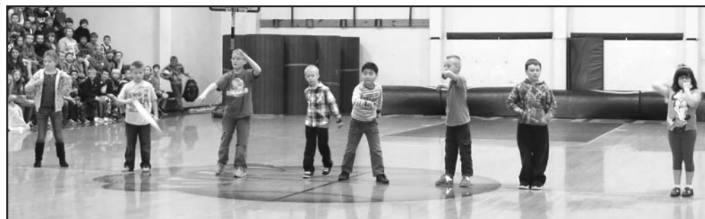
Elementary students participate in the final flights for paper airplanes

On Tuesday, November 24th the Union County Elementary students hosted the final flights for Paper Airplanes. All students made paper airplanes in STEM class the previous week and had a preliminary flight to find the one in each class that flew the farthest.