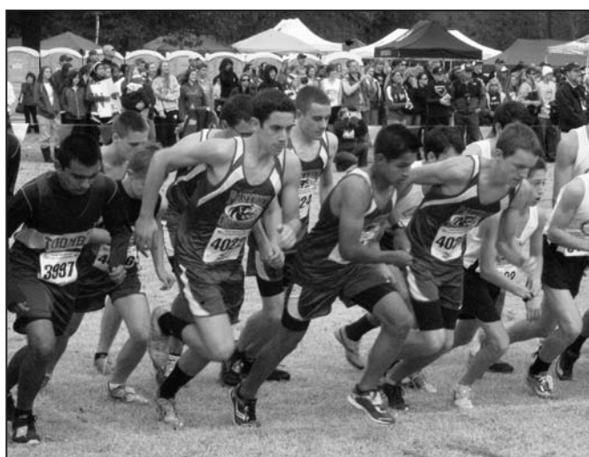
The Panthers were off to a fast start.