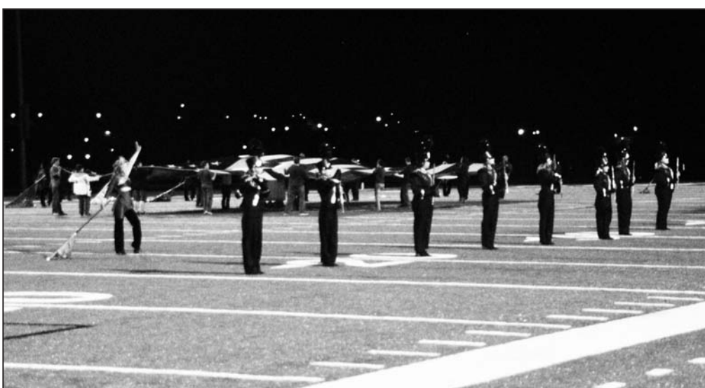
The Pride of the Mountains Marching Band provided Panther fans with a thrilling performance last Friday for Senior Night.