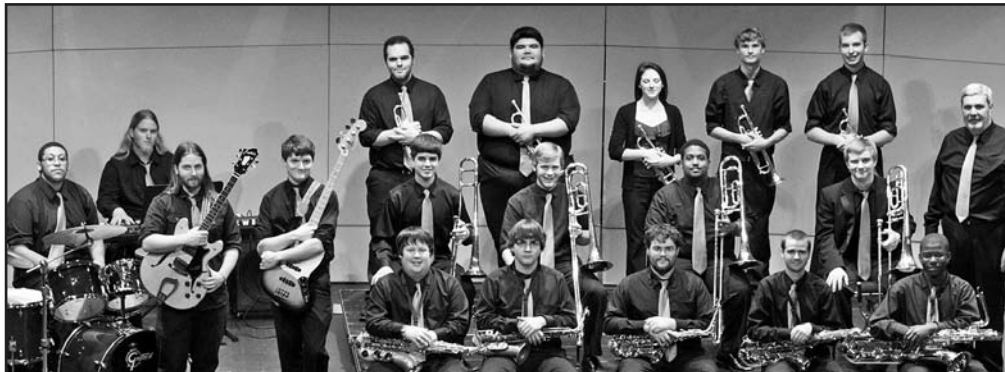
The YHC Jazz Band to perform on November 12th in Glenn Auditorium

Young Harris College's Division of Fine Arts will present the Young Harris College Jazz Band in concert Monday, Nov. 12, at 7 p.m. in Glenn Auditorium of the Clegg Fine Arts Building on the YHC campus. The performance is free and open to the public.