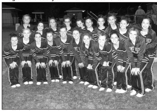
The Union County cheerleaders have traveled many miles in all types of weather to support Panther football.

off the Redskins and returned it to midfield, setting up the Panthers' final score of the game.