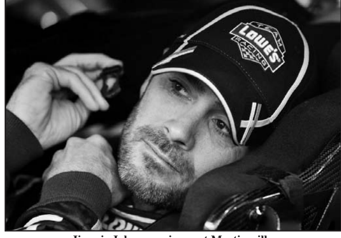
Jimmie Johnson, winner at Martinsville

One of the biggest losers was Denny Hamlin. First, he was hit with a pit road speeding penalty, which cost him a lap, and then his car developed