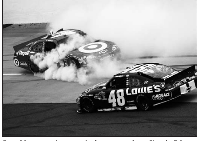
Juan Montoya spins around after contact from Jimmie Johnson during Sunday's Martinsville Cup race.

electrical problems, and had to be pushed to the garage.