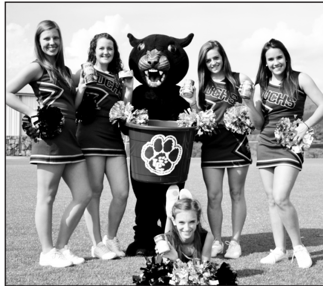
Union County High School supports Neighbor's Hand

The Union County High School Quarterback Club is teaming up with Neighbor's Hand, a local ministry, in sponsoring a canned food drive at the last home game of football season.