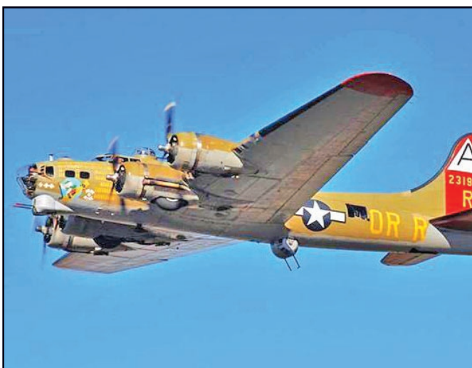
The Big Birds were flying last week at Blairsville Municipal Airport.

Over the three days of the events, hundreds visited the Blairsville Municipal Airport's North Ramp to catch a glance of the elusive warbirds.