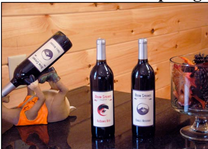
Odom Springs has rolled out Earl's Reserve .

Last week, the vineyard was open for a wine tasting with Earl's Reserve and