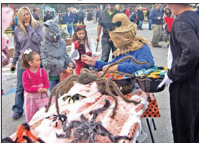
There was candy a plenty at Hometown Halloween in the downtown on Saturday. No one got tricked at all.

City streets were blocked off, and only ghouls, goblins, Ninja Turtles, a few fairies, Supermen, sharks and aliens were allowed to enter Downtown.