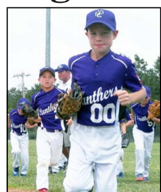
SPLOST would supply $3.4 million for Parks and Recreation.