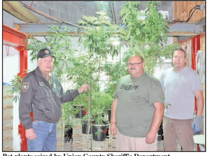
Pot plants seized by Union County Sheriff's Department

According to the sheriff's office, his Narcotics Division "will be looking into the seizure of things related to the crimes," and in the case of the 790 plants, the division "is working with other counties and states on