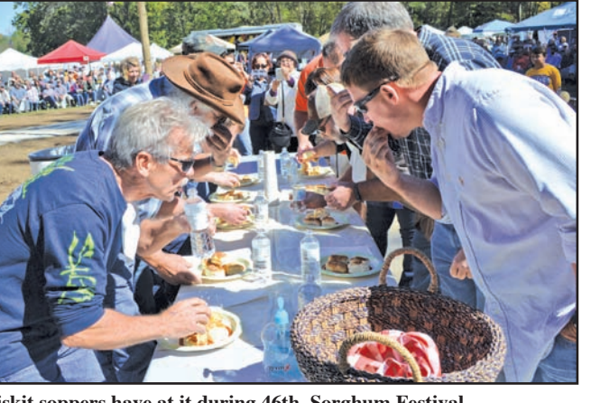
Biskit soppers have at it during 46th Sorghum Festival

By Todd Forrest North Georgia News Staff Writer