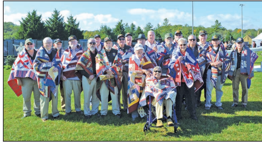
Misty Mountain Quilters present 20 Vietnam Veterans with Quilts of Valor