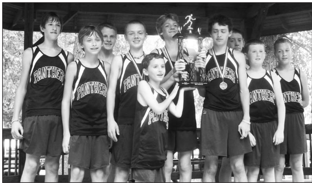
The Union County Middle School Boys Cross Country after claiming its second League title in as many years..

"There are some boys who will make an immediate impact on the success of the high school program," Coach