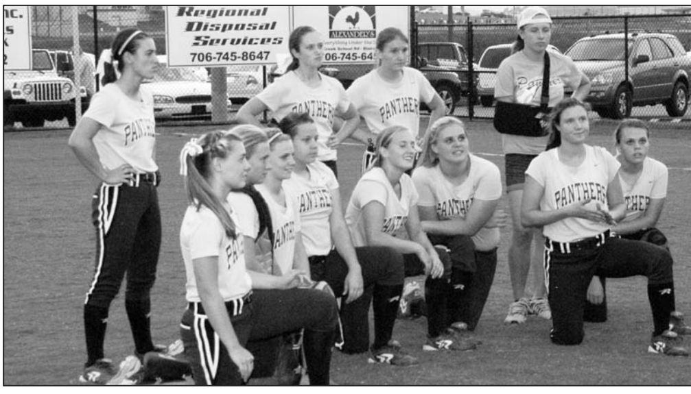
Postgame: The Union County Lady Panthers after picking up a home victory.

three more in the third thanks to another lead off double. A ground out brought in the fourth run, an opposite field single scored their fifth run, finally the sixth run came around on an error.