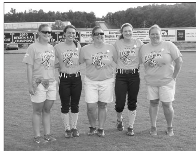
Seniors and coaches during the 'Pink Out' game.

Meanwhile, up in the mountains, Union County and