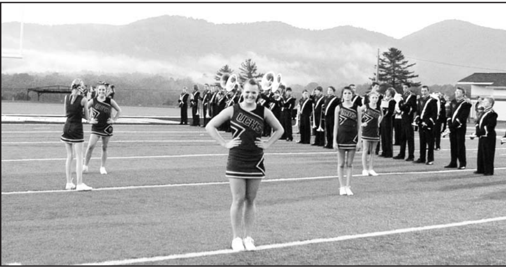
At home games, the Union County Cheerleaders and band help amp up the crowd before the Panthers take the field. They also increase crowd involvement on Friday nights.

In the 2012 meeting at Oglethorpe, the Panthers held on for a 21-14 road win. In 2008 at Oglethorpe, Union won 37-34.