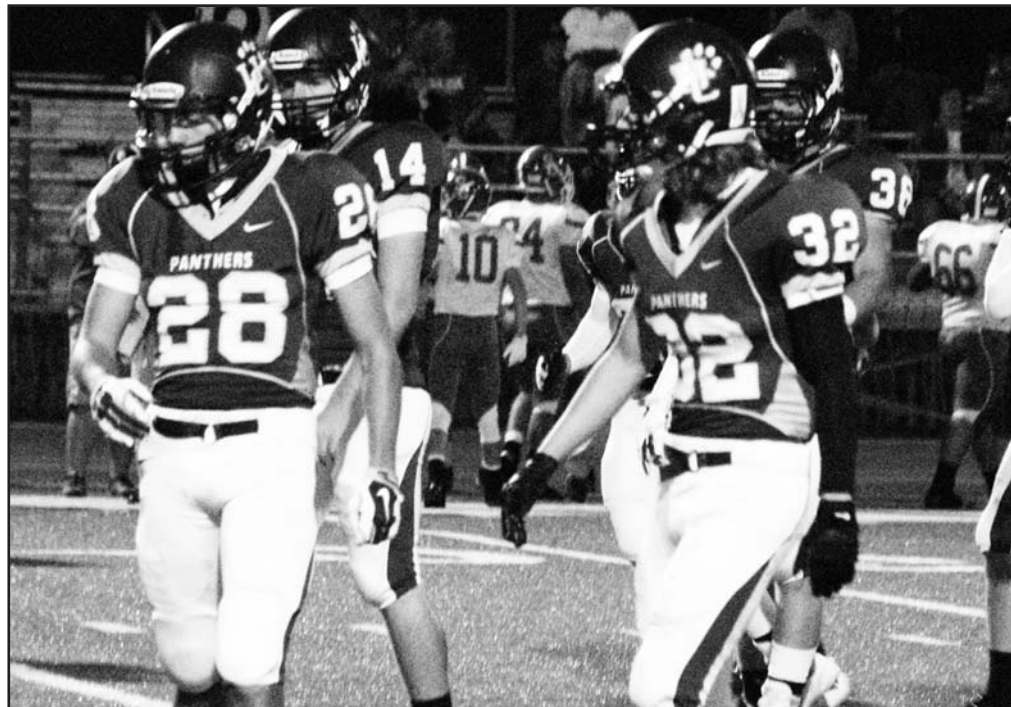
The Union defense limited the Redskins to just 6 points in the first three quarters. They also forced four turnovers and recorded its first touchdown of the year.