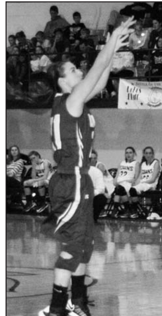
Union County heated up in a hurry from the outside during a second half flurry of 3-pointers.

The win over Towns was just Union's second in the last eight meetings but Union goes into the off season with a win over Towns for the second consecutive season. The difference