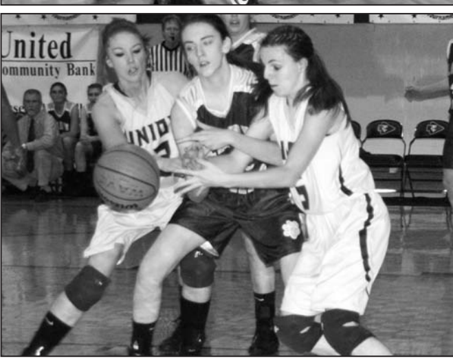
The Union County Lady Panthers in action vs Dawson County in the BOTS finals.