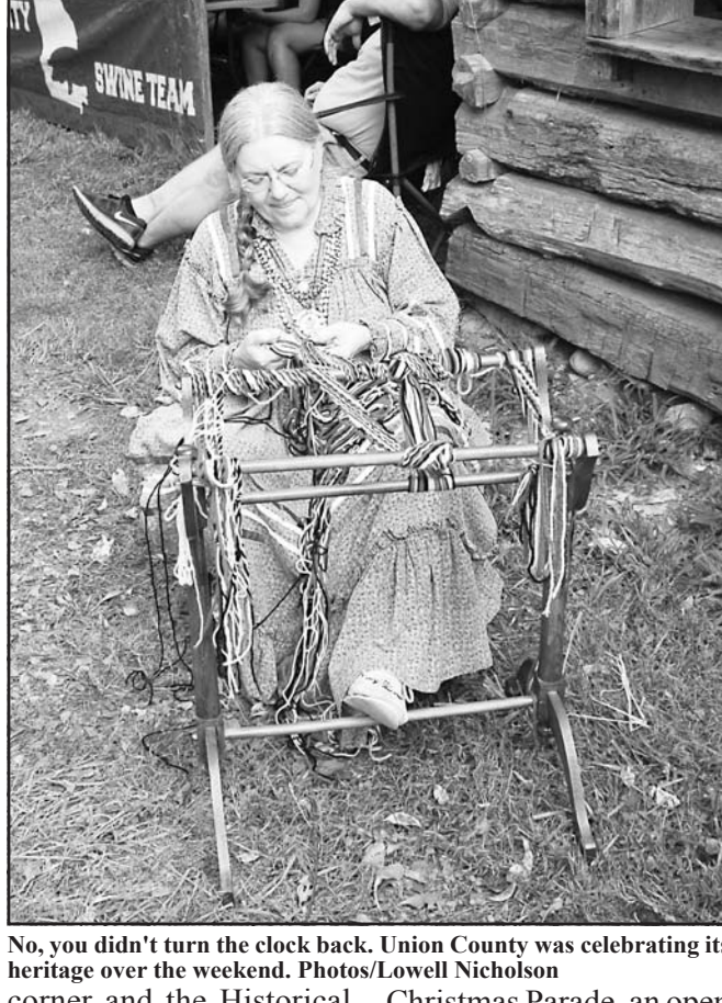
No, you didn't turn the clock back. Union County was celebrating its heritage over the weekend.

corner and the Historical Society will be hosting its annual Christmas Celebration.