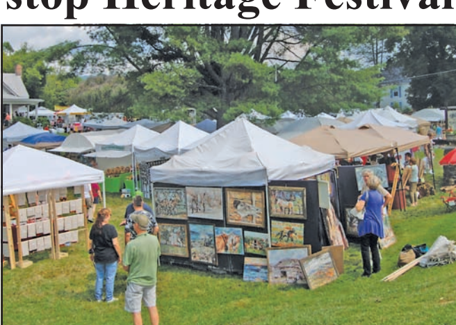
Record numbers flocked to the two-day event.