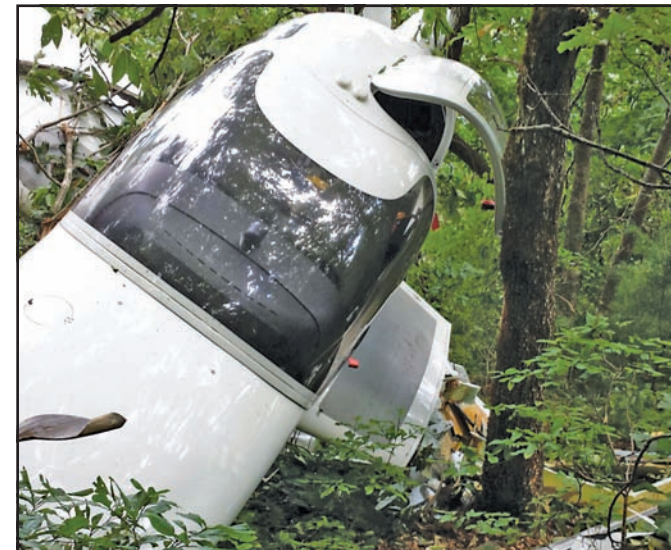
A Suwanee couple survived a crash on Horsetrough Mountain on Friday, following a case of lost situational awareness Union County emergency officials said.