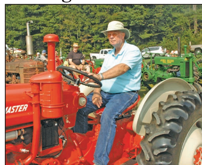
When you see the tractors at the Farmers Market, you know it's time for the Hall of Fame inductions.

He's the past president of the Blue Ridge Mountains Cattleman's Association.