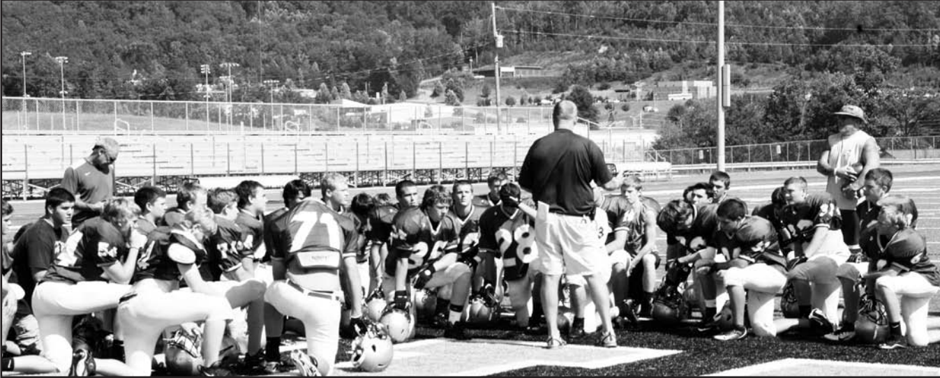
Union County Panther football practice