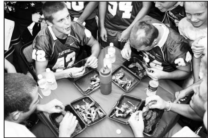
Meet the Team