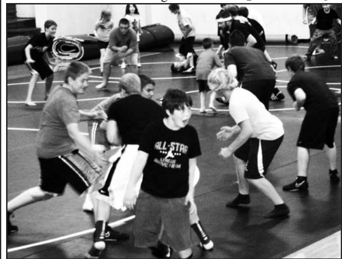
More than 50 young adults and kids attended last week's Open Mat days at The Pit.