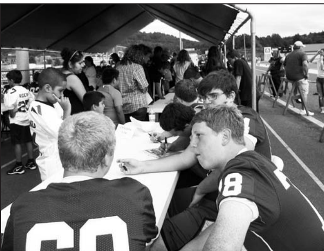
Players signing autographs.