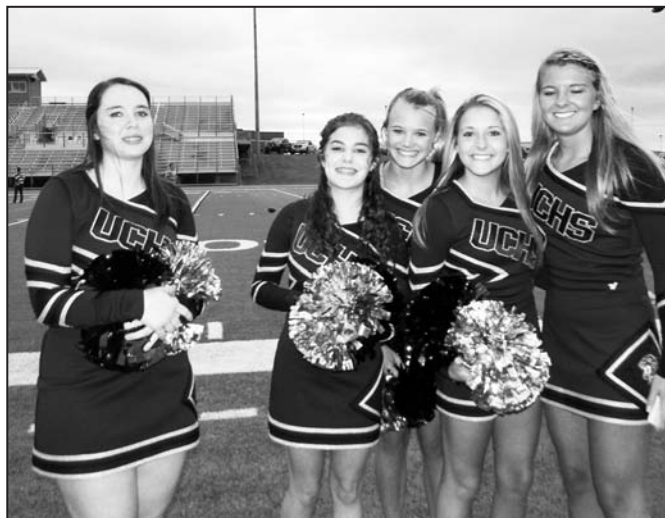
Union County High School Cheerleaders.