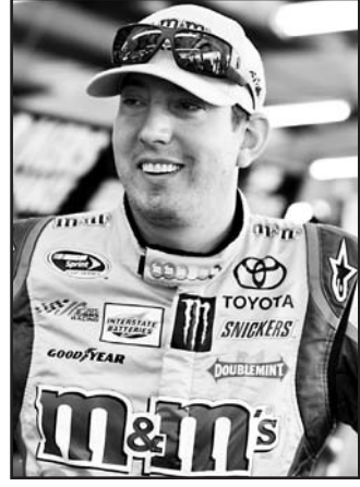
"Rowdy" Kyle Busch, Cup winner at the Glen

During lap 80, Kasey Kahne spun, and was then hit by his team-