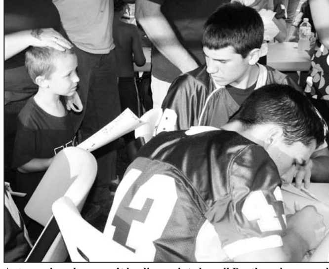
Autograph seekers won't be disappointed as all Panther players and coaches will be on hand to sign autographs and pose for pictures until each and every request has been granted.