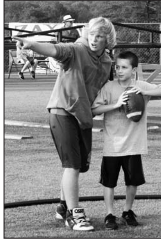
Meet the Team Day will feature contests for all ages and skill levels.

This is a can't-miss event and a good way to ring in the 2013 season which looks to be a promising one. Everyone is invited to attend and for all the die hard Panther fans out there, this is a good way to ease the pigskin withdrawals.