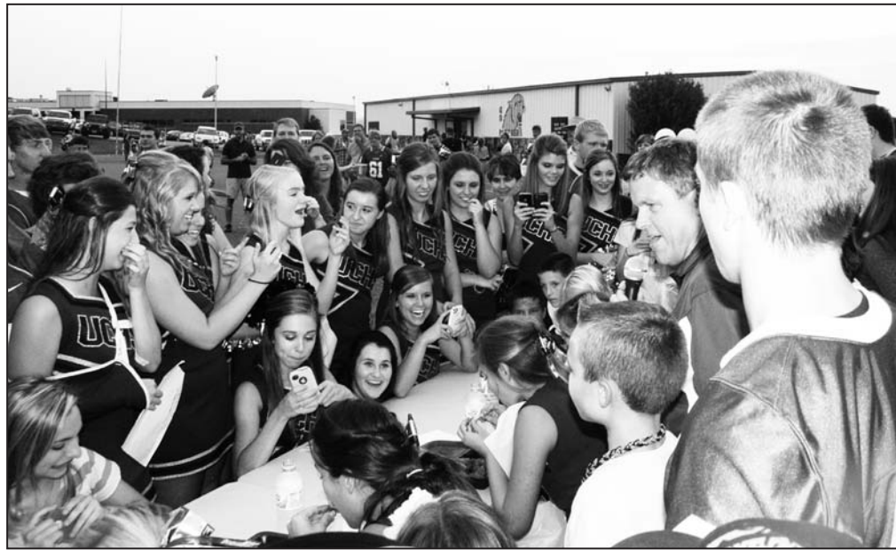
The Zaxby's hot-wing eating contest was one of the highlights of last year's Meet the Team. Even the cheerleaders weren't afraid to get in on the action and challenge the guys.

Games and contests between the children attending were held on the field with plenty of competition between all ages