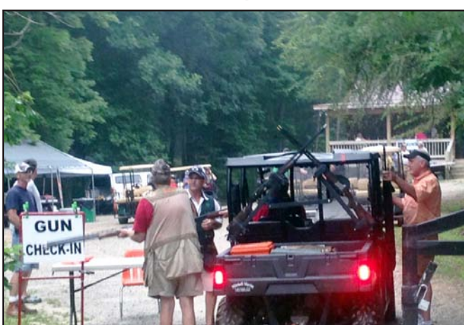
The Fourth Annual 4-H Sporting Clays event was a success as usual.

The funds generated will go toward the cost of clay targets, updating and maintaining equipment, insurance,