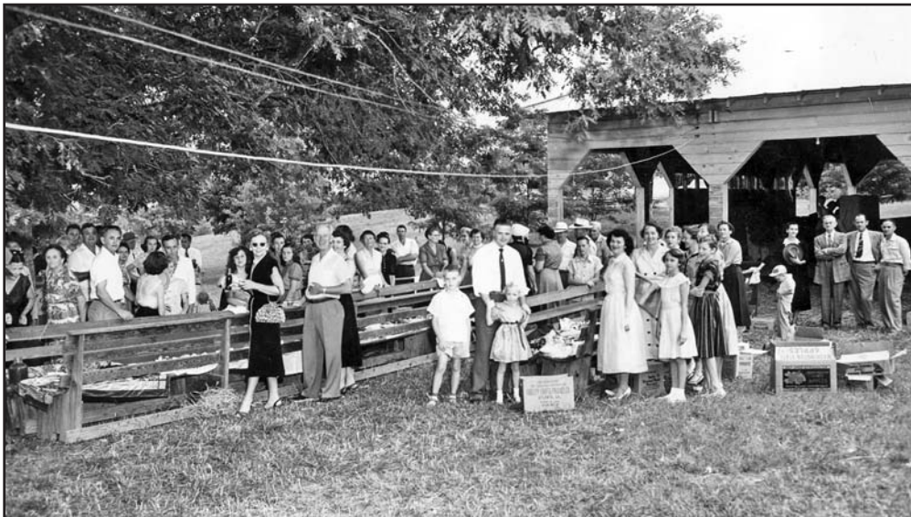
The Annual Reece Reunion has been ongoing since August 1931. It's the oldest family reunion in Union County.