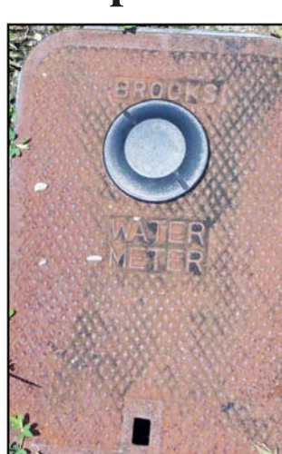
The black hockey puck-looking device is a high-tech electronic sensor that sends water usage data to a City laptop to determine a City water customer's monthly water usage.

"Where we had four people reading the old meters and it took two or three days, we have one person reading the new meters in three hours," Mayor Conley said. "A lot of our meters were old and inefficient. A lot of people