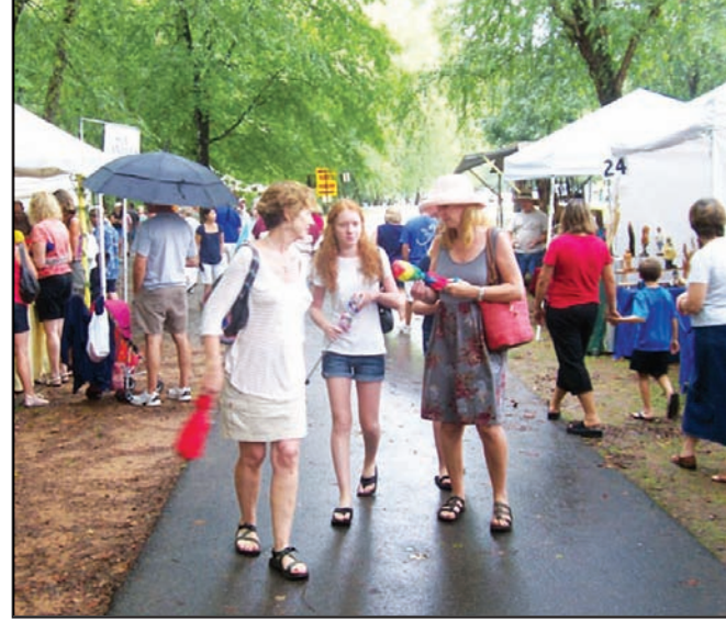
Event goers braved the rain to shop at the 14th Annual Butternut Creek Festival. It was another successful year.

The 70 artists and crafters who participated are the best in the Southeast -- each carefully juried to ensure the quality of their works and to achieve a balanced presentation of unique and original art and handcrafted works.