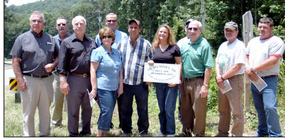
Union County government played a role in a new guard rail on Skeenah Gap Road in memory of 16-year-old Cody Dwayne Morgan.

By Todd Forrest North Georgia News Staff Writer