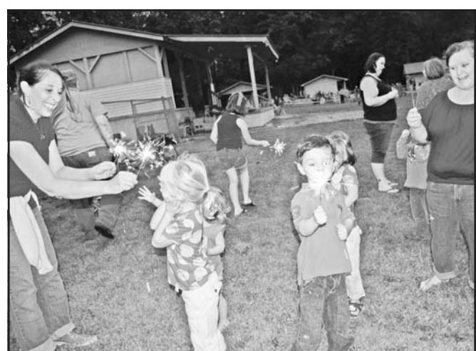
Saturday was fun for young and old alike.