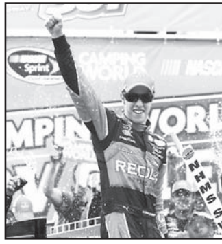
Brad Keselowski wins at New Hampshire.

"Calling it a union would be incorrect," he said. "A union would be for employees. The