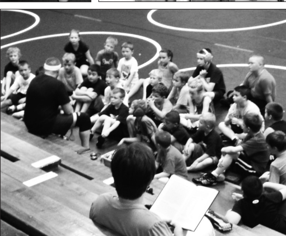
Youth Wrestling nights at the Pit offered something for everyone. Now Union County wrestling will take a break until the school year begins and the season opens in the fall.