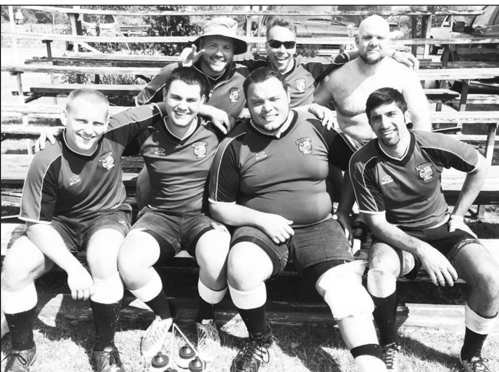
The Blue Ridge Mountain Rugby Club picked up its first ever Top three finish last month in Columbus.

On Saturday, June 21st, Blue Ridge Mountain Rugby Football Club traveled to Columbus GA to play in the longest running 7's tournament in GA (31 years).