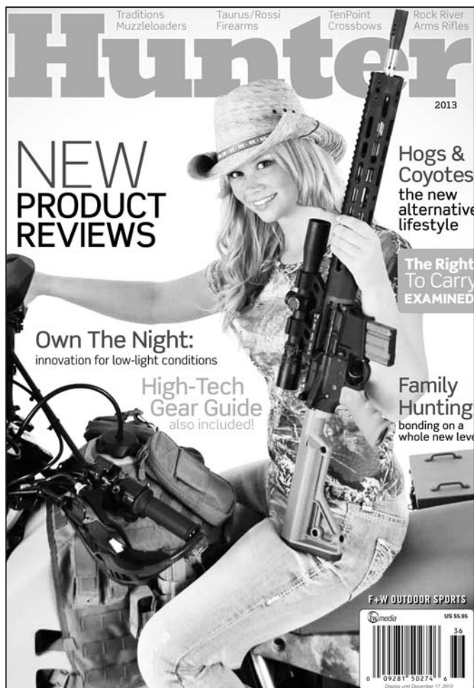
Brittney is regular on hunting shows, has graced the cover of numerous magazines, and is always making appearances at different events.

- Black cerakoted blade with black grips, pink bolts and pink claw (butt), and her signature engraved in pink, with "Huntress." The "Huntress" comes with a black kydex sheath engraved with her signature and