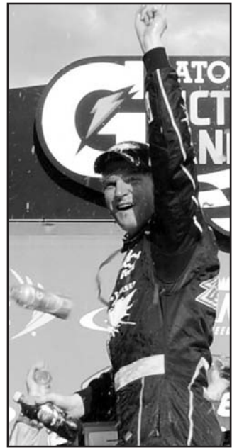
Dale Earnhardt Jr. wins at Michigan.

After a restart with four laps left, Logano crossed the finish line .208 seconds ahead of runner-up Buescher to claim his fifth victory in 11 Nationwide starts this season and the