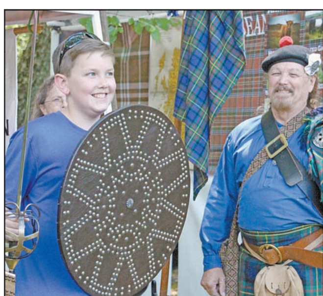
A young visitor to the 13th Annual Blairsville Scottish Festival & Highland Games borrows some heavy equipment from a member of the MacLaren clan on Saturday, June 11, in order to pose for a picture taken by his family.

"We give thanks to our Mased Bands and ask that you watch over them and they