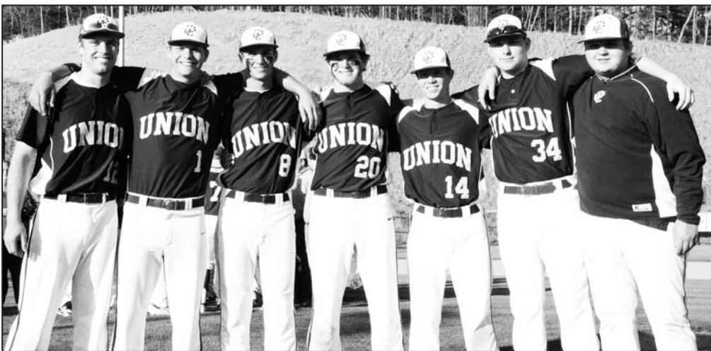
Union County Panther baseball's seniors during Senior Night.

he was going to be there for the team. One of the compliments that I got from an opposing coach is, 'I can't believe he's just a sophomore.'"