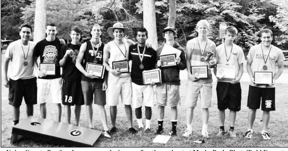
Union County Panthers' soccer award winners after the cookout at Meeks Park.