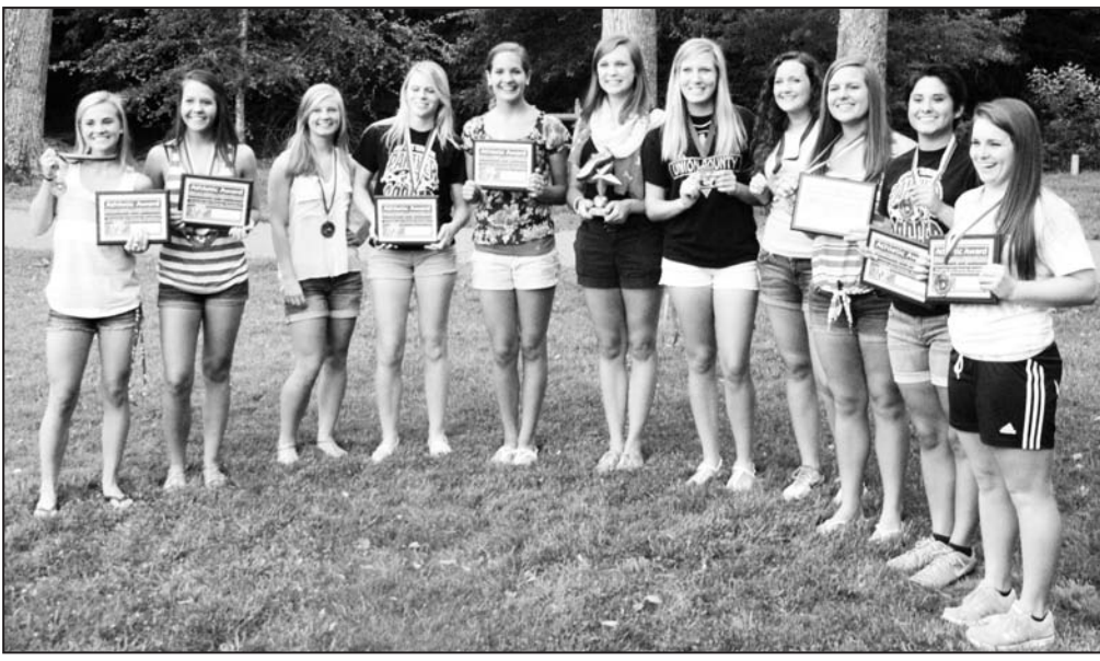
Lady Panthers' soccer award winners after the cookout at Meeks Park.