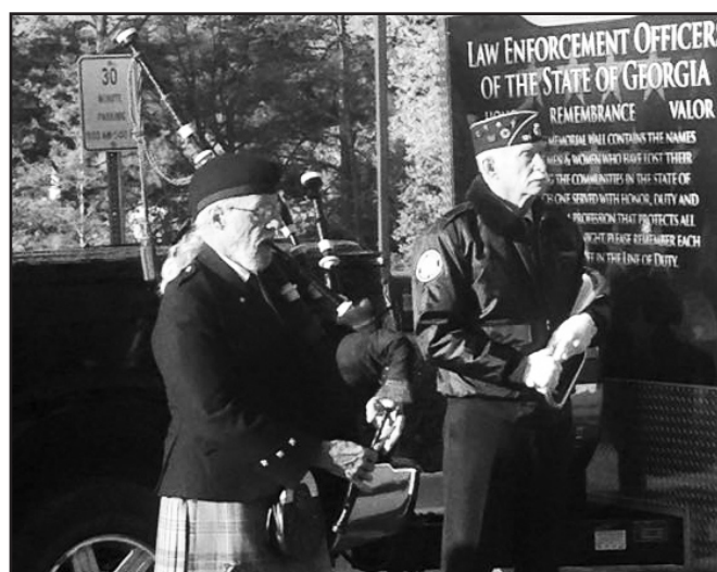
Bagpipes and bugles performed during the opening ceremonies.