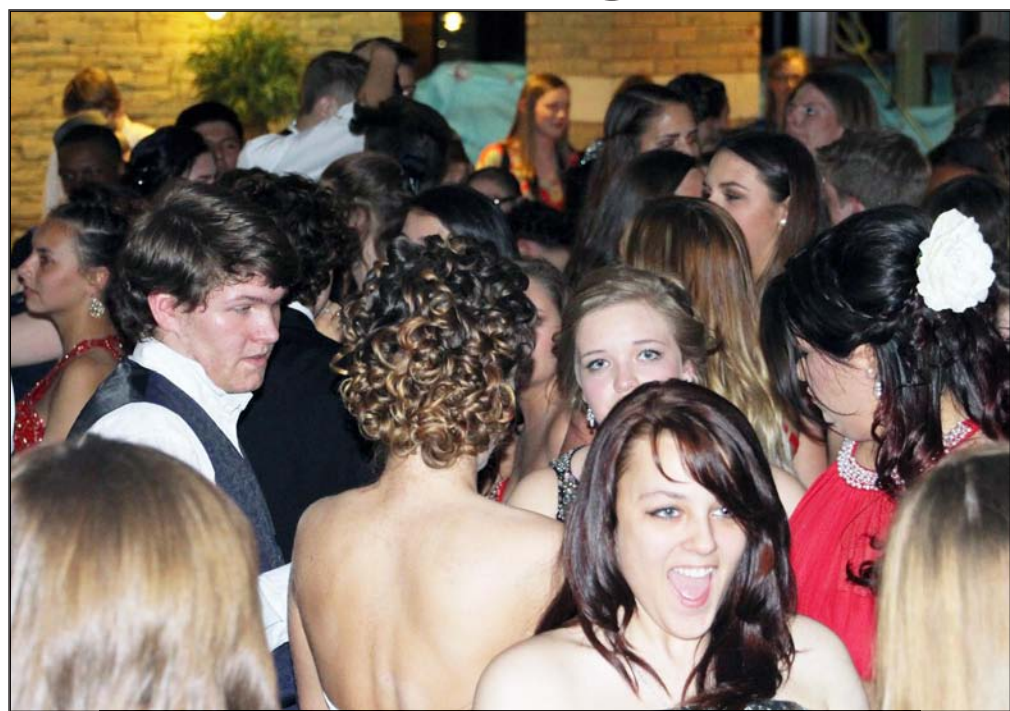
UCHS students dance the night away at the 2016 Junior-Senior Prom, which took place at North Georgia Technical College on Saturday, April 16.