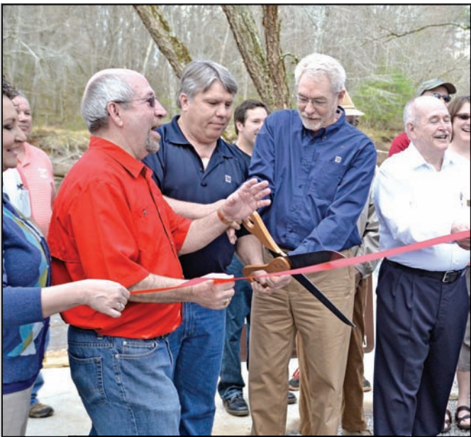
Let the fun begin! The Notetely River Headwaters Access is now open for fun. A large crowd turned out for the ribbon cutting.

land, which borders Meeks Park, will provide additional uses along with an extension of the current walking trails, especially during the Scottish Festival and Highland Games in June and the Annual Sorghum Festival in October.