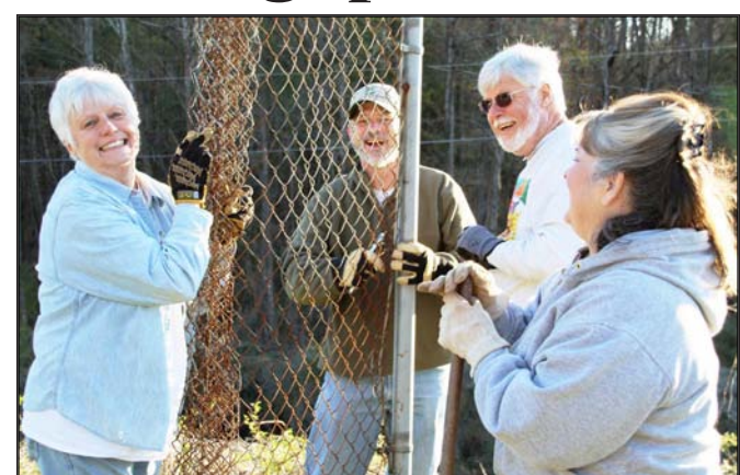
Highway, right before you get to Pruitt Circle, though no one would remember the fence that has