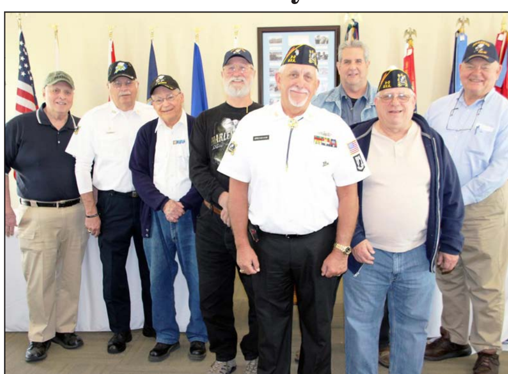
2016 officers after having been sworn in at the April 8 meeting of the Seabee Island X-3.