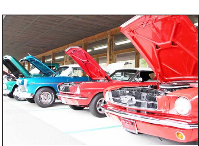
All proceeds from ticket sales and donations go toward local children's charities, including the Blairsville Police Department's "Shop with a Cop" program.