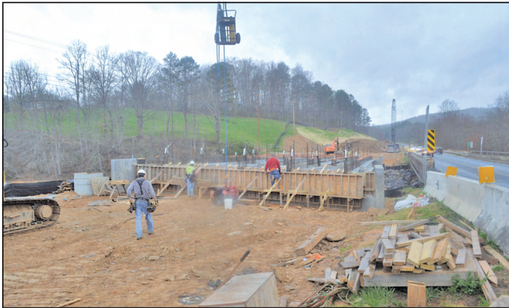
Construction on the $3.57 million bridge continues. Weather permitting, the new bridge on the Murphy Highway could be complete as early as June, possibly July.

bridge project will be the construction of a 900-foot concrete retaining wall just past the bridge project as you drive toward Murphy, NC, Paris said.