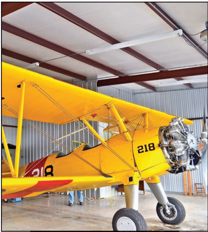
Blairsville Municipal Airport was the place to be on Saturday as Leadership Union hosted Airport Awareness Day.