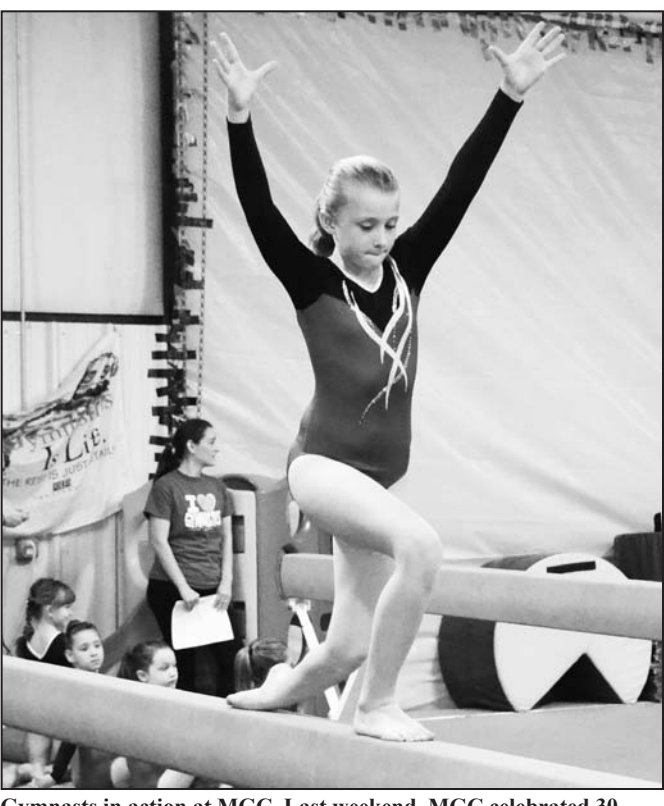
Gymnasts in action at MGC. Last weekend, MGC celebrated 30 years with an open house. Check next week's North Georgia News' Sports section for pictures from MGC's 30-year celebration.