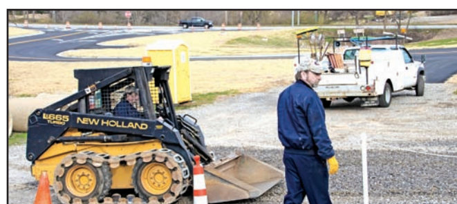
City of Blairsville workers spread gravel to shore up the parking lot adjacent to the new off ramp of the Haralson Development Project