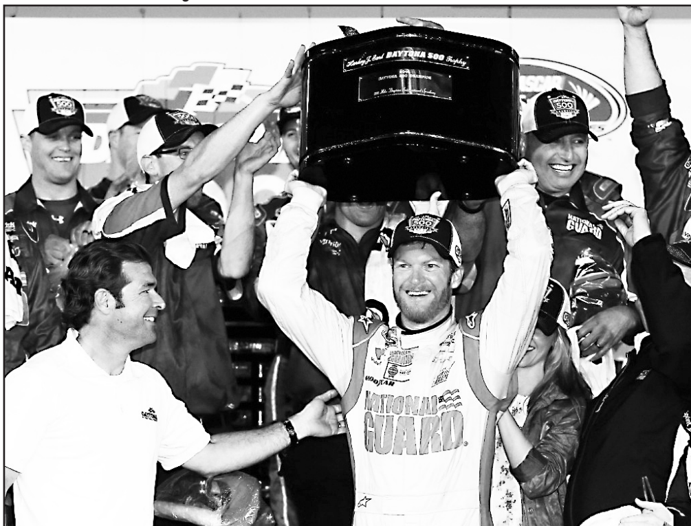
Dale Earnhardt Jr. wins Daytona 500 credited with a 40th-place finish.

Danica Patrick was finished for the night and was