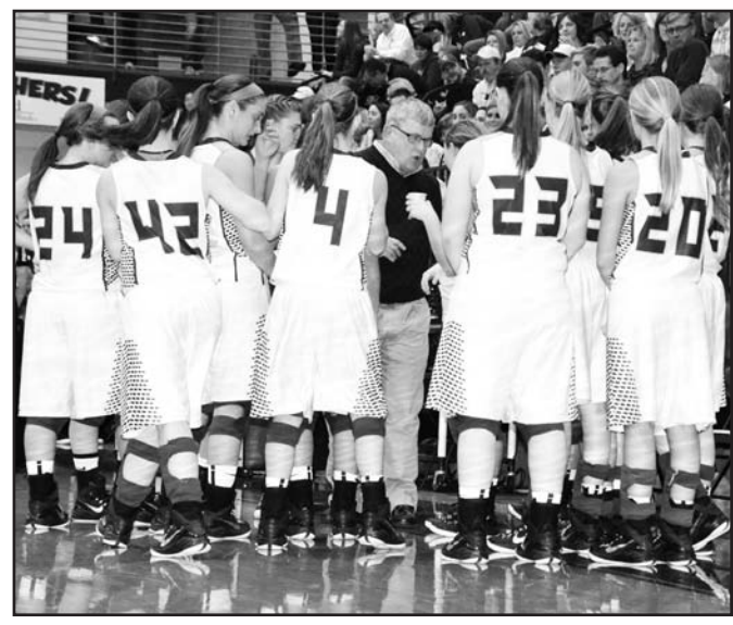
Coach Tucker and the Lady Panthers during a timeout.

As for the rest of Region 8-AA last week: Union was the only team to not lose by double-digits. Top seeded Rabun fell on their homecourt, 61-51 to Dade County. Model smoked Greene County 70-29 and Armuchee took out Oglethorpe County 63-49.