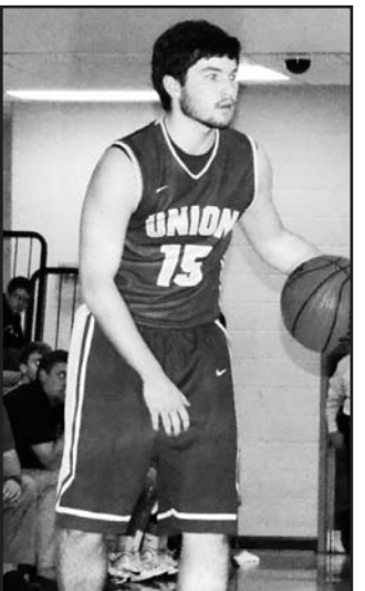
Senior Lake Arnick

As for the rest of Region 8-AA in the State Playoffs. No. 1 Greene County beat Armuchee 83-75 before getting eliminated by Thomasville in round two. No. 2 Rabun defeated Darlington 83-69 but lost to Seminole County in round two. No. 4 Washington Wilkes fell 72-52 at No. 1 Model.