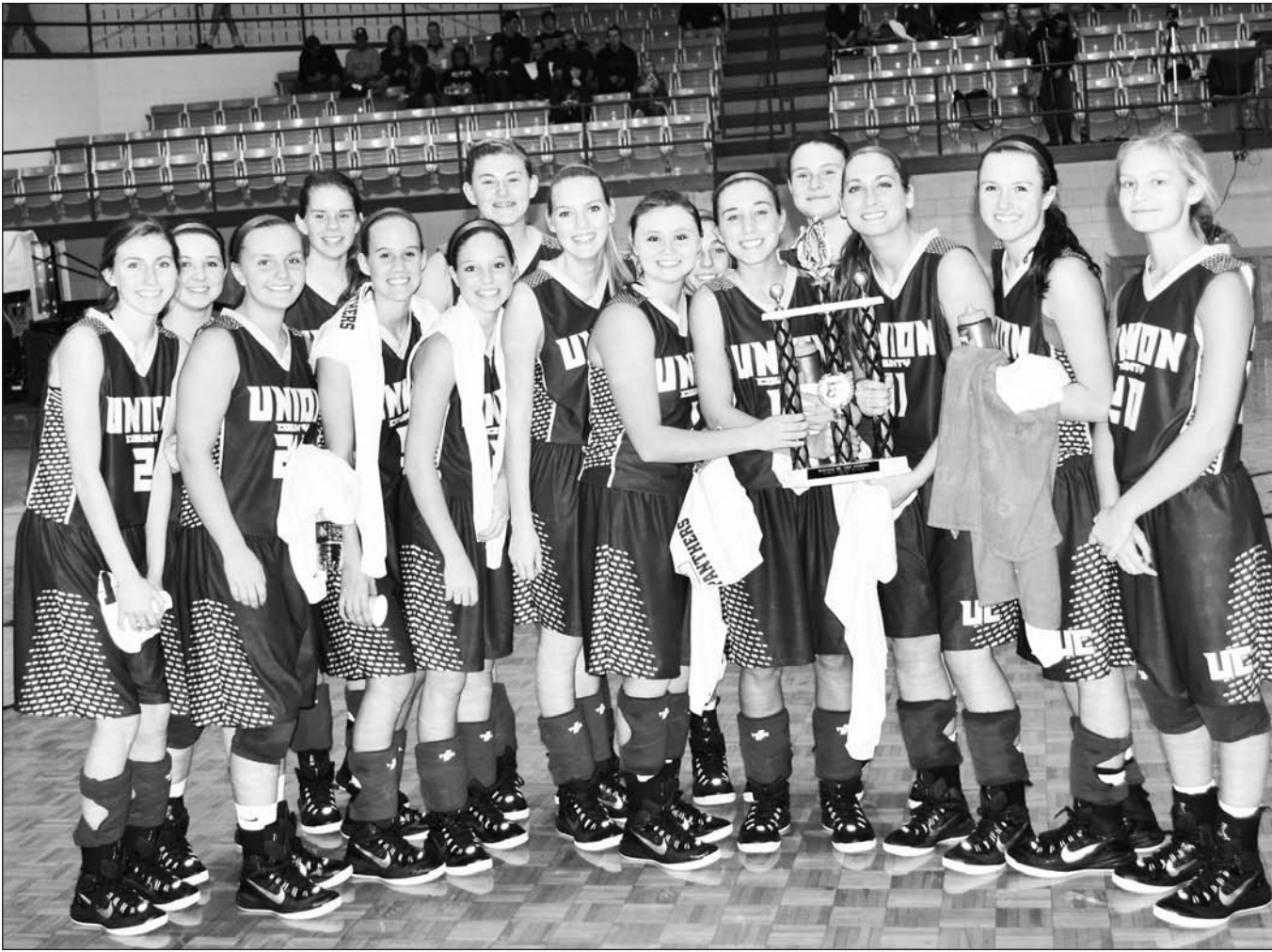
The Union County Lady Panthers after finishing third in the Battle of the States. Despite getting knocked out in the first round of State, the Lady Panthers provided its fans with a memorable season, reaching State for the 17th time in school history.

Union would cool off dramatically in the final 8 minutes of the half and were unable to connect on a field goal, allowing the Lady Tigers to