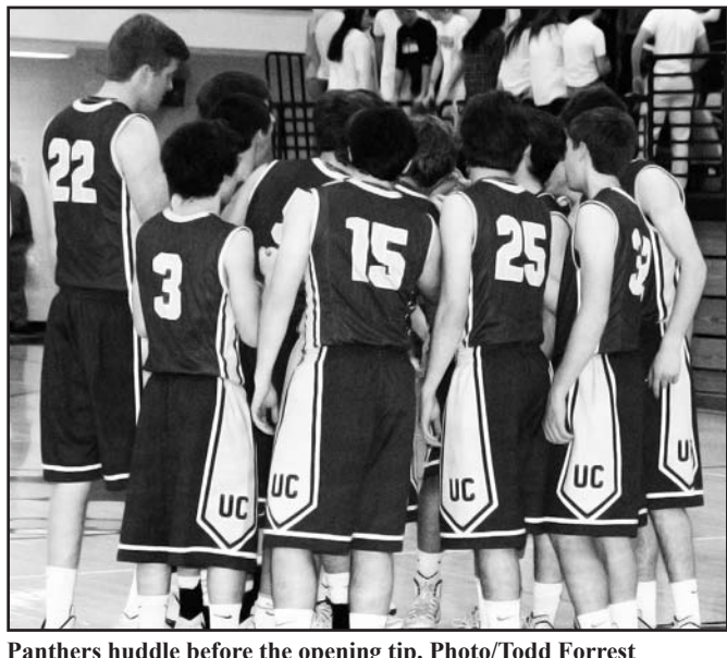
Panthers huddle before the opening tip.

SCORING: Hamby 17, Odom 16, Hughes 15, Shook 8,