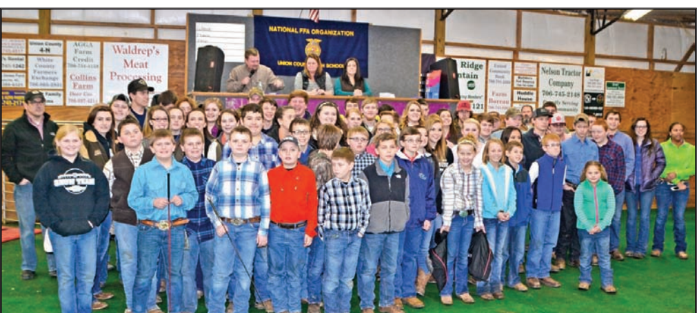
AG Students from six counties compete in showmanship and for best market hog at Pig Jig