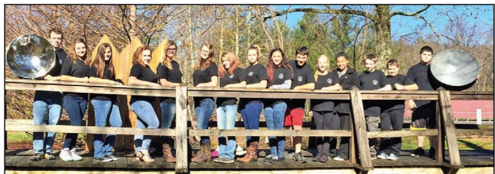
Woody Gap's Band of Steel

The program, which is titled "Steel in Love" will