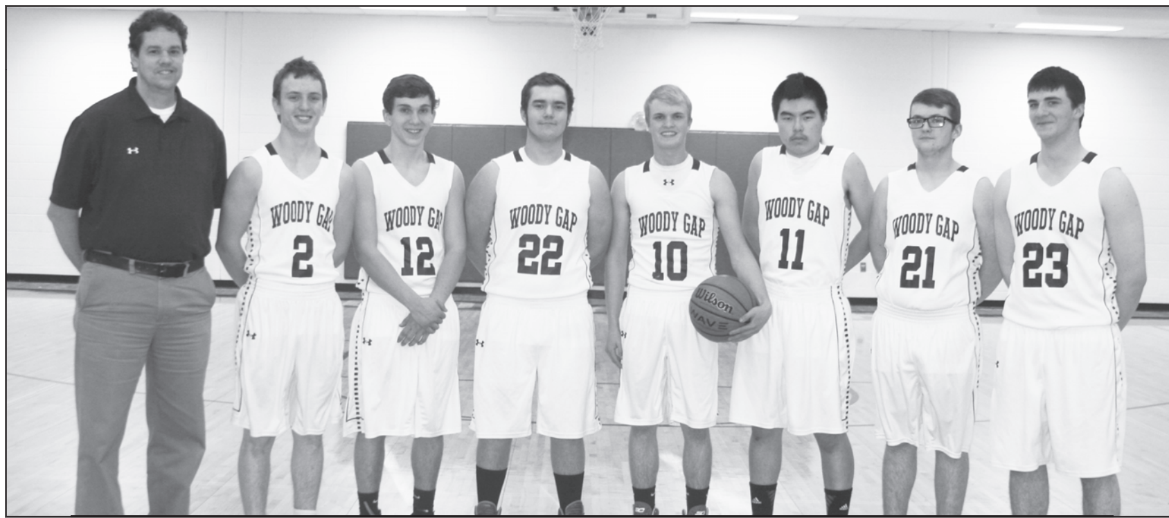
Woody Gap High School 2015-16 girls and boys basketball teams.