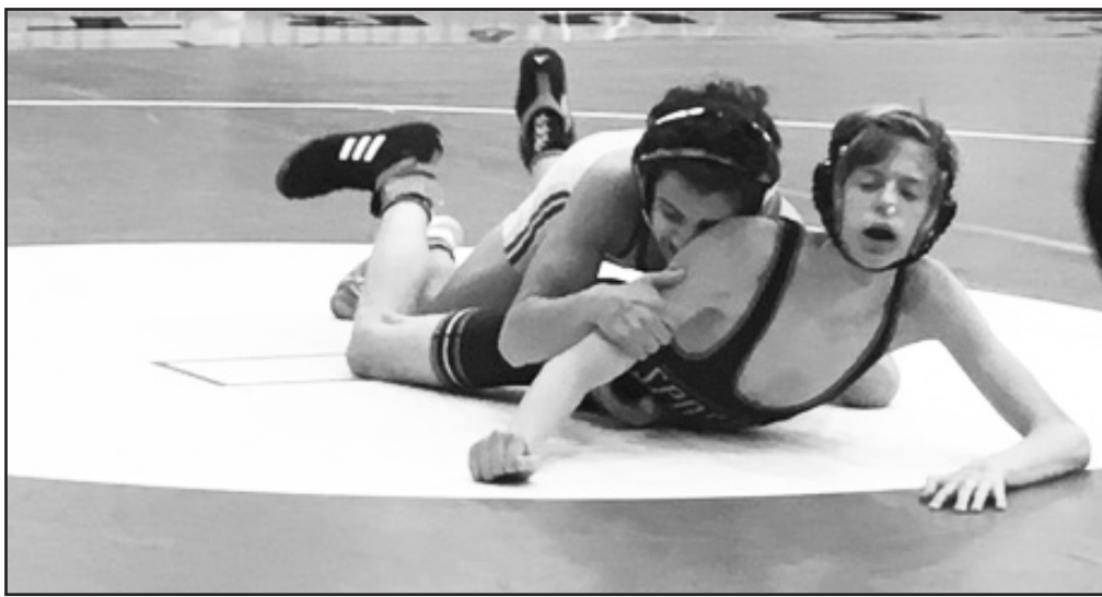
Union County wrestling against Greater Atlanta Christian at the Area Tournament (left). Union County in action vs Riverside Military Academy at the Area Tournament (right).

This week, Union has their final home match on Tuesday