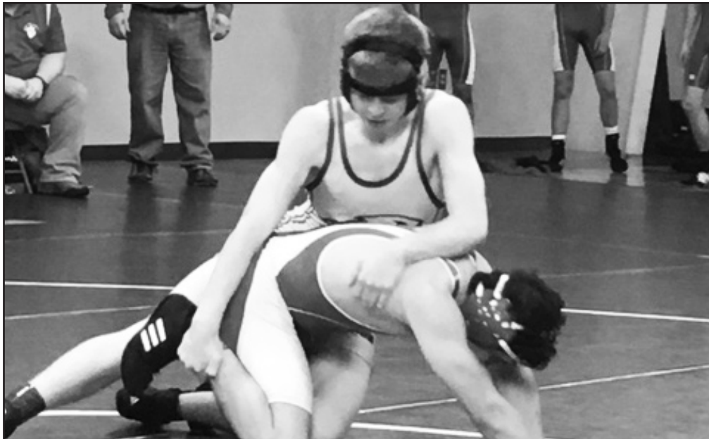
Union County Wrestling places two at the Amicalola Classic.