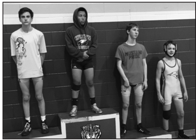
Union County Wrestling places two at the Amicalola Classic.