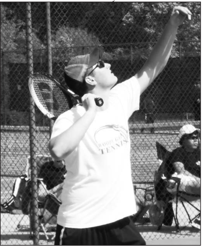
The Woody Gap Falcons men's tennis team reached the State Tournament in 2013.