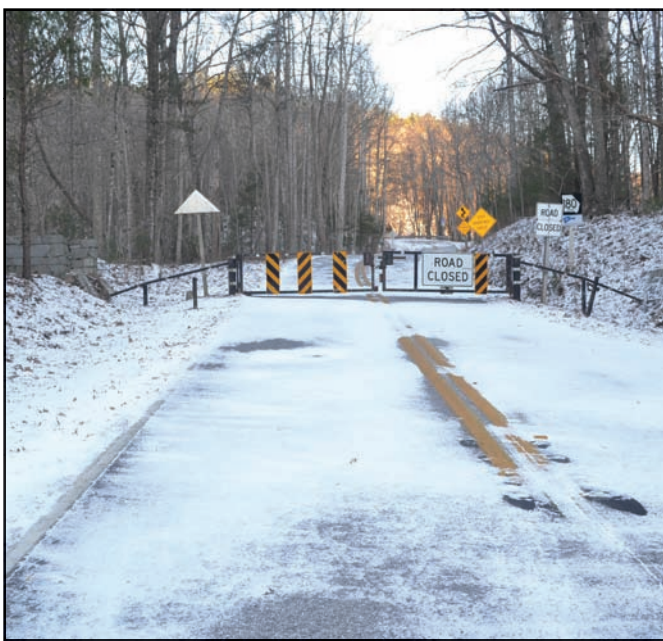
Highway 180 was the first road closed in the state in 2014.

The frigid weather interfered with the morning commute as snow flurries continued and Union County's Road Department worked feverishly to remedy the roadway nightmare. Union County Schools were closed, well, because